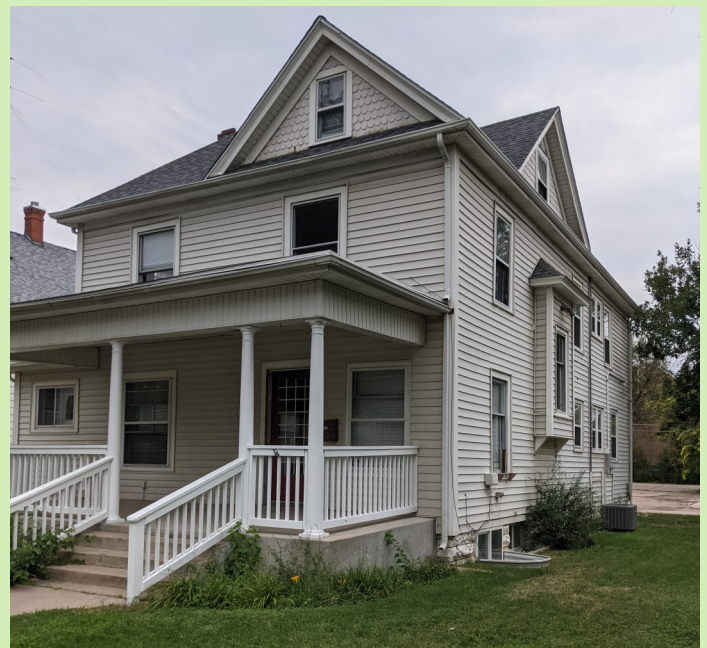
The House of Hope Resident Manager is an important part of the House of Hope, helping both to keep things running smoothly and foster a sense of community within the house.